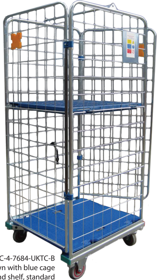
STRC-4-7684-UKTC-B Shown with blue cage base and shelf, standard color is gray.