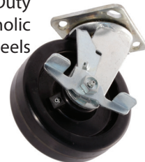
Heavy Duty Phenolic Wheels

Custom designs and additional sizes available upon request.