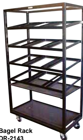
Bagel Rack DR-2143