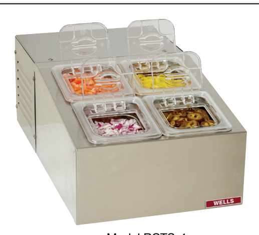
Model RCTS-4 (food not included)