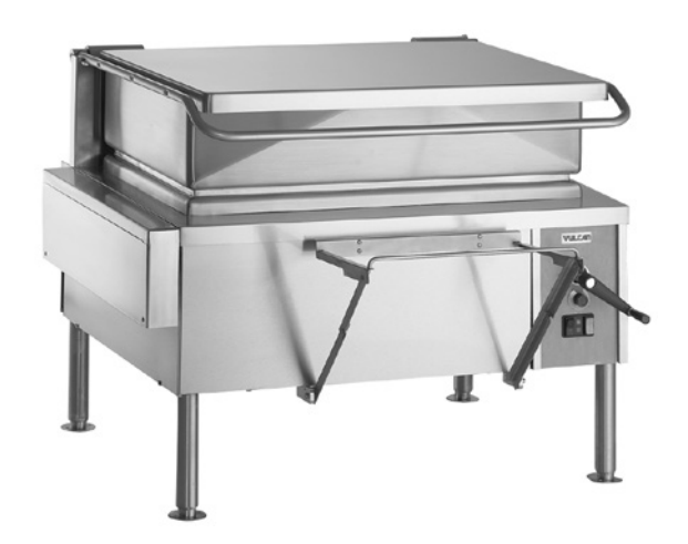
Shown with enclosed faucet bracket