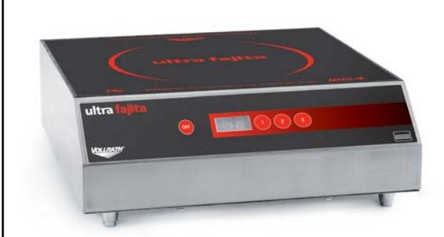
Ultra Induction Fajita Skillet Heater