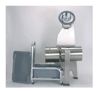
FOOD CART SHOWN WITH VCM