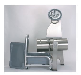
FOOD CART SHOWN WITH VCM