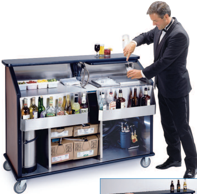
Model 889 shown with optional Post-Mix dispensing system and optional Bag-in Box rack kit.