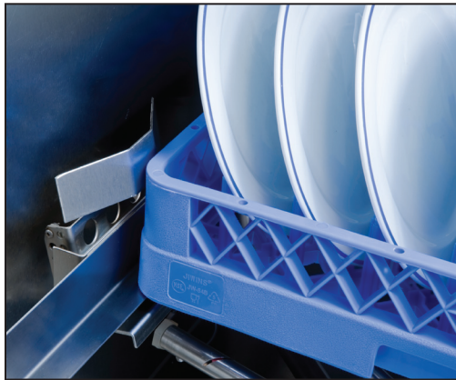
RackAware™ Automatic Rack Sensing System* only runs a cycle when a rack is present