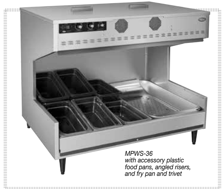
MPWS-36 with accessory plastic food pans, angled risers, and fry pan and trivet