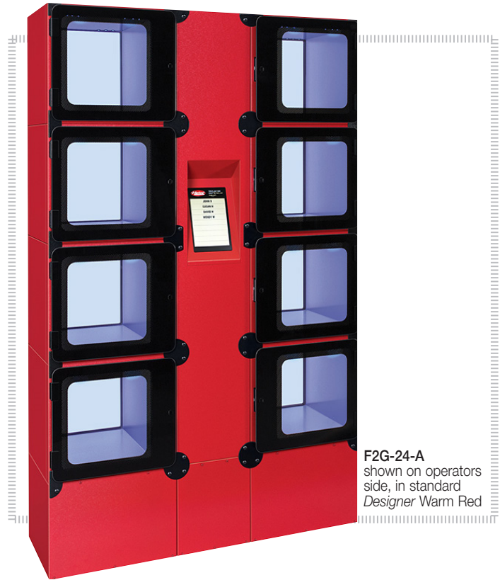
F2G-24-A shown on operators side, in standard Designer Warm Red