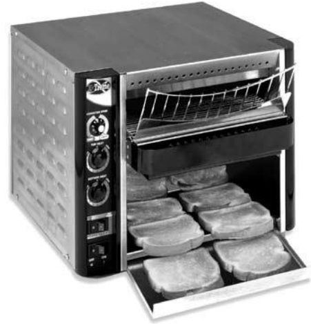
Model X*treme -2