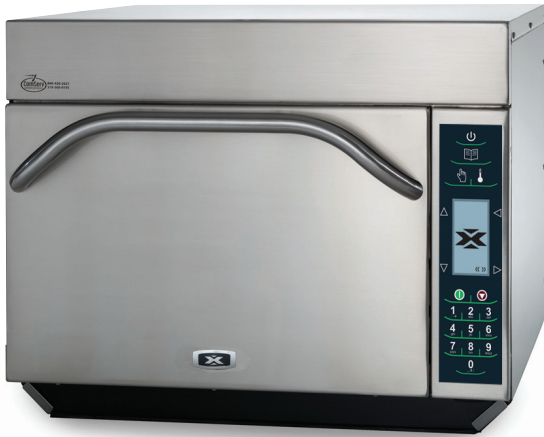
Model AXP22 shown

15 times faster than conventional ovens.