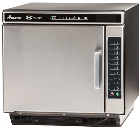
Model ACE19V shown