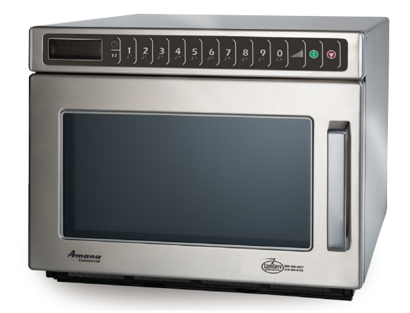
Model HDC12A2 shown