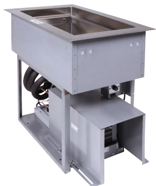
100-CW Cold Well