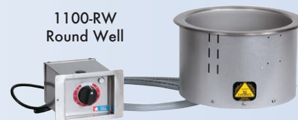
1100-RW Round Well