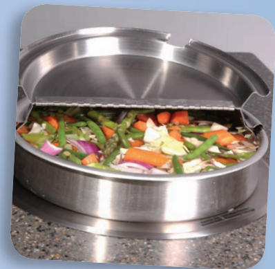
700-RW Round Well (Pan not included)

equipped with an adjustable thermostat to provide the optimal holding temperature to prevent the overcooking and scorching of food that is associated with traditional soup wells.