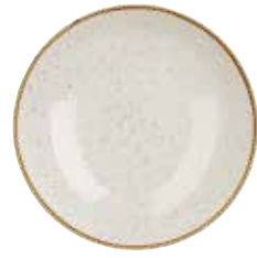
LARGE COUPE BOWL SWHSPLC21 31cm 12" 240cl 84.5oz CTN QTY 6 +