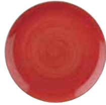
COUPE PLATE SBRSEV101 26cm 10¼" CTN QTY 12 +