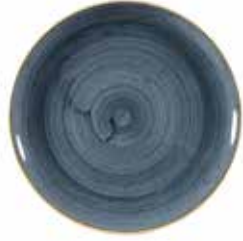
COUPE PLATE SBBSEV111 28.8cm 11¼" CTN QTY 12 ✦