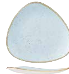
TRIANGLE PLATE SDESTR121 31.1cm 12 1/4" CTN QTY 6 ✦ SDESTR101 26.5cm 10 1/2" CTN QTY 12