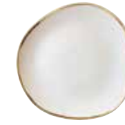
ORGANIC ROUND PLATE SWHSOG8 1 21cm 8 1 / 4 " SWHSOG7 1 18.6cm 7 1 / 4 " CTN QTY 12