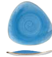
TRIANGLE PLATE SCFSTR91 22.9cm 9" SCFSTR71 19.2cm 7¾" CTN QTY 12