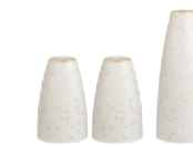
SALT SWHSSSA 1 7cm 2 1/2" CTN QTY 12 PEPPER SWHSSPE 1 7cm 2 1/2" CTN QTY 12 BUD VASE SWHSSBV 1 12.5cm 5" CTN QTY 6