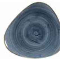
TRIANGLE PLATE SBBSTR121 31.1cm 12¼" CTN QTY 6