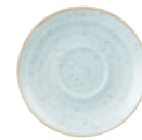
ESPRESSO SAUCER SDESSS1 11.8cm 4 1/2" CTN QTY 12 (Fits SDESCEB91)