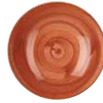
COUPE BOWL SSOSEVB91 24.8cm 9¾" 113.6cl 40oz CTN QTY 12 SSOSEVB71 18.2cm 7¼" 42.6cl 15oz CTN QTY 12