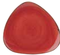
TRIANGLE PLATE SBRSTR9 1 22.9cm 9" CTN QTY 12