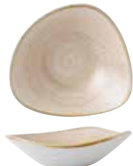
TRIANGLE BOWL SNMSTRB91 23.5cm 9¼" 60cl 21oz CTN QTY 12