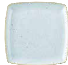
DEEP SQUARE PLATE SDESDS101 26.8cm 10 1/2" CTN QTY 6