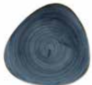
TRIANGLE PLATE SBBSTR9 1 22.9cm 9" CTN QTY 12 SBBSTR7 1 19.2cm 7¾" CTN QTY 12