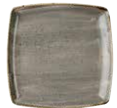
DEEP SQUARE PLATE SPGSDS101 26.8cm 10 1/2" CTN QTY 6