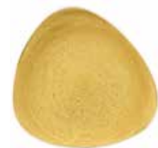
TRIANGLE PLATE SMSSTR101 26.5cm 10½" CTN QTY 12