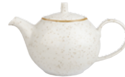
BEVERAGE POT SWHSSB151 42.6cl 15oz H: 10.5cm CTN QTY 4 REPLACEMENT LID SWHSRL151 CTN QTY 6