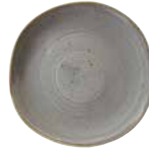
ORGANIC ROUND PLATE SPGSOG111 28.6cm 11 1/4" SPGSOG101 26.4cm 10 3/8" SPGSOG8 1 21cm 8 1/4" SPGSOG7 1 18.6cm 7 1/4" CTN QTY 12