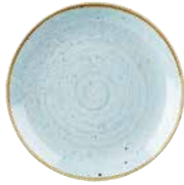
COUPE PLATE SDESEV121 32.4cm 12 3/4" CTN QTY 6 ✦ SDESEV111 28.8cm 11 1/4" CTN QTY 6 ✦ SDESEV101 26cm 10 1/4" CTN QTY 12 ✦