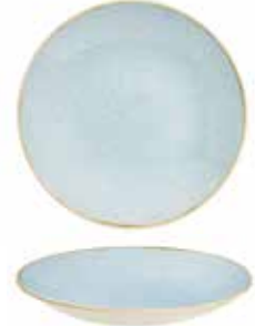
DEEP COUPE PLATE SDESPD271 28.1cm 11" H: 3.7cm CTN QTY 12 ✦