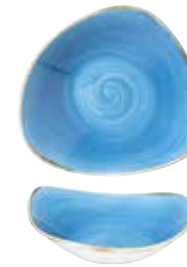
TRIANGLE BOWL SCFSTRB91 23.5cm 9¼" 60cl 21oz SCFSTRB71 18.5cm 7¼" 37cl 13oz CTN QTY 12