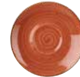
SAUCER SSOSCSS 1 15.6cm 6¼" CTN QTY 12 (Fits SSOSCB281 & SSOSCB201)