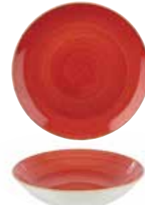
COUPE BOWL SBRSEVB91 24.8cm 9¾" 113.6cl 40oz CTN QTY 12 + SBRSEVB71 18.2cm 7¼" 42.6cl 15oz CTN QTY 12 +