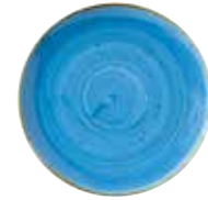
COUPE PLATE SCFSEVP81 21.7cm 8⅔" CTN QTY 12 SCFSEVP61 16.5cm 6½" CTN QTY 12