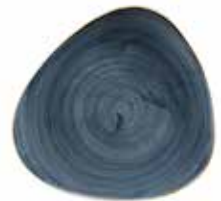
TRIANGLE PLATE SBBSTR101 26.5cm 10½" CTN QTY 12