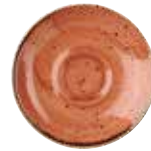
ESPRESSO SAUCER SSOESS 1 11.8cm 4½" CTN QTY 12 (Fits SSOSCEB91)