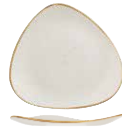
TRIANGLE PLATE SWHSTR121 31.1cm 12 1 / 4 " CTN QTY 6 SWHSTR101 26.5cm 10 1 / 2 " CTN QTY 12 SWHSTR9 1 22.9cm 9" CTN QTY 12 SWHSTR7 1 19.2cm 7 3 / 4 " CTN QTY 12