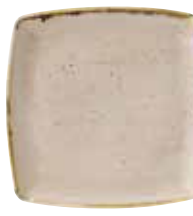
DEEP SQUARE PLATE SNMSDS101 26.8cm 10½" CTN QTY 6