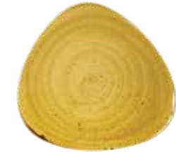
TRIANGLE PLATE SMSSTR121 31.1cm 12¼" CTN QTY 6