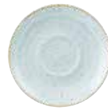
SAUCER SDESSS1 15.6cm 6 1/4" CTN QTY 12 (Fits SDESCB441, SDESCB401 SDESCB281 & SDESCB201)