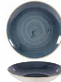
COUPE BOWL SBBSEVB71 18.2cm 7¼" 42.6cl 15oz CTN QTY 12 ✦