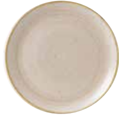
COUPE PLATE SNMSEV121 32.4cm 12¾" CTN QTY 6