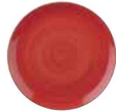
COUPE PLATE SBRSEVP61 16.5cm 6½" CTN QTY 12 +