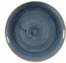
COUPE PLATE SBBSEVP81 21.7cm 8⅔" CTN QTY 12 ✦