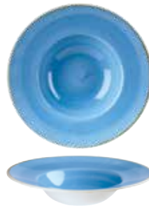
WIDE RIM BOWL SCFSVWBM1 24cm 9½" 28.4cl 10oz CTN QTY 12