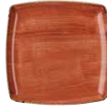
DEEP SQUARE PLATE SSOSDS101 26.8cm 10½" CTN QTY 6