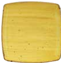
DEEP SQUARE PLATE SMSSDS101 26.8cm 10½" CTN QTY 6