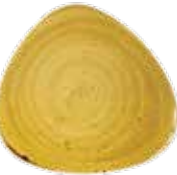
TRIANGLE PLATE SMSSTR7 1 19.2cm 7¾" CTN QTY 12