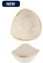
TRIANGLE BOWL SNMSTRB71 18.5cm 9¼" 37cl 13oz CTN QTY 12 SNMSTRB61 15.3cm 6" 26cl 9oz CTN QTY 12