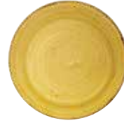
COUPE PLATE SMSSEVP61 16.5cm 6½" CTN QTY 12 ✦