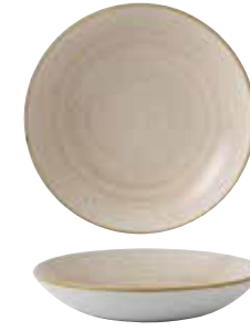
COUPE BOWL SNMSPLC21 31cm 12" 240cl 84.5oz CTN QTY 6