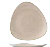
TRIANGLE PLATE SNMSTR71 19.2cm 7¼" CTN QTY 12