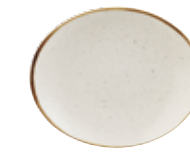
OVAL COUPE PLATE SWHSOP7 1 19.2cm 7 3 / 4 " CTN QTY 12 +