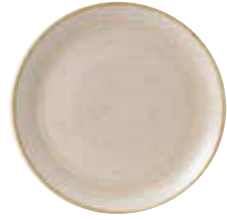
COUPE PLATE SNMSEV111 28.8cm 11¼" CTN QTY 12 SNMSEV101 26cm 10¼" CTN QTY 12