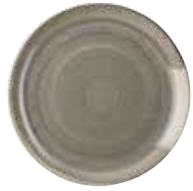
COUPE PLATE SPGSEVP81 21.7cm 8 2/3" CTN QTY 12 ✦ SPGSEVP61 16.5cm 6 1/2" CTN QTY 12 ✦