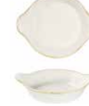
BARLEY WHITE LARGE ROUND EARED DISH SWHSLREN1 17.5 x 21.5cm 7 x 8 1/2" 59cl 20.8oz CTN QTY 6 SWHSSREN1 15 x 18cm 5 7/8 x 7 1/8" 30cl 10.6oz CTN QTY 6