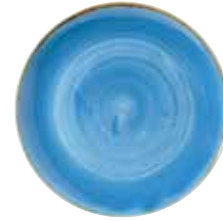
LARGE COUPE BOWL SCFSPLC21 31cm 12" 240cl 84.5oz CTN QTY 6