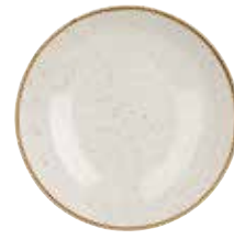
COUPE BOWL SWHSEVB91 24.8cm 9 3 / 4 " 113.6cl 40oz CTN QTY 12 + SWHSEVB71 18.2cm 7 1 / 4 " 42.6cl 15oz CTN QTY 12 +