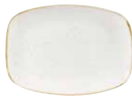
OBLONG PLATTER No. 9 SWHSXP141 35.5 x 24.5cm 13 7 / 8 x 9 5 / 8 " CTN QTY 6