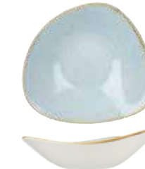
TRIANGLE BOWL SDESTRB91 23.5cm 9 1/4" 60cl 21oz SDESTRB71 18.5cm 7 1/4" 37cl 13oz SDESTRB61 15.3cm 6" 26cl 9oz CTN QTY 12