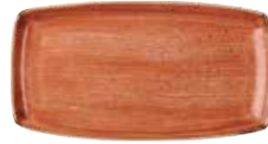
OBLONG PLATE SSOSOP141 35 x 18.5cm 14" x 7¼" CTN QTY 6 SSOSOP111 29.5 x 15cm 11¾" x 6" CTN QTY 12