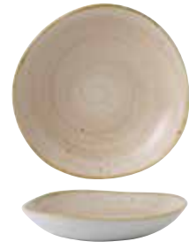
ORGANIC ROUND BOWL SNMSOGB11 25.3cm 9¾" 110cl 38oz CTN QTY 12