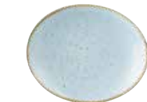
OVAL COUPE PLATE SDESOP7 1 19.2cm 7 3/4" CTN QTY 12 ✦