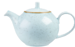
BEVERAGE POT SDESSB151 42.6cl 15oz H: 10.5cm CTN QTY 4 REPLACEMENT LID SDESRL151 CTN QTY 6