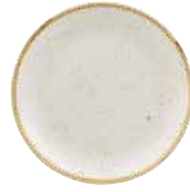
COUPE PLATE SWHSEVP81 21.7cm 8 2 / 3 " CTN QTY 12 + SWHSEVP61 16.5cm 6 1 / 2 " CTN QTY 12 +