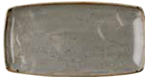
OBLONG PLATE SPGSOP141 35 x 18.5cm 14" x 7 1/4" CTN QTY 6 SPGSOP111 29.5 x 15cm 11 3/4" x 6" CTN QTY 12