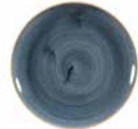
COUPE PLATE SBBSEVP61 16.5cm 6½" CTN QTY 12 ✦