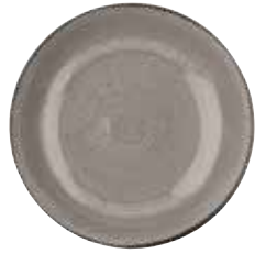
LARGE COUPE BOWL SPGSPLC21 31cm 12" 240cl 84.5oz CTN QTY 6 ✦