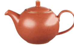
BEVERAGE POT SSOSSB151 42.6cl 15oz H: 10.5cm CTN QTY 4 REPLACEMENT LID SSOSRL151 CTN QTY 6