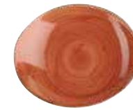
OVAL COUPE PLATE SSOSOP7 1 19.2cm 7¾" CTN QTY 12