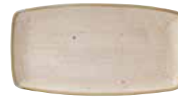
OBLONG PLATE SNMSOP111 29.5 x 15cm 11¾" x 6" CTN QTY 12