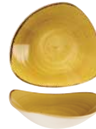
TRIANGLE BOWL SMSSTRB91 23.5cm 9¼" 60cl 21oz CTN QTY 12