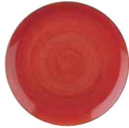
COUPE PLATE SBRSEV121 32.4cm 12¾" CTN QTY 6 + SBRSEV111 28.8cm 11¼" CTN QTY 12 +