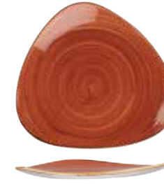
TRIANGLE PLATE SSOSTR121 31.1cm 12¼" CTN QTY 6 SSOSTR101 26.5cm 10½" CTN QTY 12 SSOSTR9 1 22.9cm 9" CTN QTY 12 SSOSTR7 1 19.2cm 7¾" CTN QTY 12