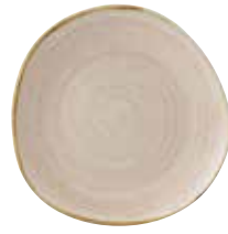
ORGANIC ROUND PLATE SNMSOG81 21cm 8¼" CTN QTY 12