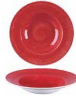
WIDE RIM BOWL SBRVWBL1 28cm 11" 46.8cl 16.5oz CTN QTY 12 + SBRVWBM1 24cm 9½" 28.4cl 10oz CTN QTY 12 +