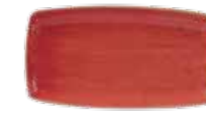
OBLONG PLATE SBR SOP111 29.5 x 15cm 11¾" x 6" CTN QTY 12