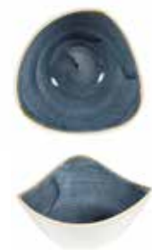
TRIANGLE BOWL SBBSTRB71 18.5cm 9¼" 37cl 13oz CTN QTY 12