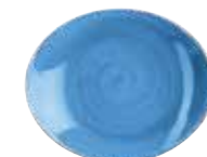
OVAL COUPE PLATE SCFSOP71 19.2cm 7¾" CTN QTY 12