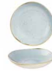
ORGANIC ROUND BOWL SDESOGB11 25.3cm 9 3/4" 110cl 38oz CTN QTY 12