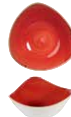
TRIANGLE BOWL SBRSTRB71 18.5cm 9¼" 37cl 13oz CTN QTY 12 SBRSTRB61 15.3cm 6" 26cl 9oz CTN QTY 12