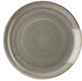
COUPE PLATE SPGSEV121 32.4cm 12 3/4" CTN QTY 6 ✦ SPGSEV111 28.8cm 11 1/4" CTN QTY 12 ✦ SPGSEV101 26cm 10 1/4" CTN QTY 12 ✦