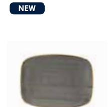
NEW PEPPERCORN GREY CHEFS' OBLONG PLATE No. 8 SPGSOBL41 30 x 19.9cm CTN QTY 6 No. 7 SPGSOBL31 26.1 x 20.2cm CTN QTY 12 No. 6 SPGSOBL21 23.7 x 15.7cm CTN QTY 12 No. 5 SPGSOBL11 15.4 x 12.6cm CTN QTY 12