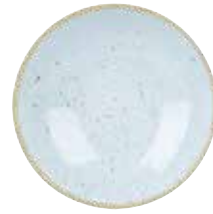
COUPE BOWL SDESEVB91 24.8cm 9 3/4" 113.6cl 40oz CTN QTY 12 ✦ SDESEVB71 18.2cm 7 1/4" 42.6cl 15oz CTN QTY 12 ✦