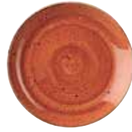
COUPE PLATE SSOSEVP81 21.7cm 8⅔" CTN QTY 12 SSOSEVP61 16.5cm 6½" CTN QTY 12