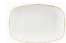
OBLONG PLATE No. 8 SWHSOBL41 30 x 19.9cm 12" x 7 4 / 5 " CTN QTY 6