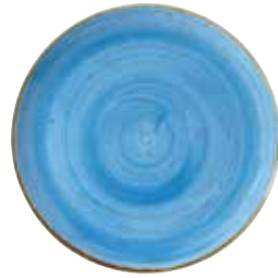
COUPE PLATE SCFSEV121 32.4cm 12¾" CTN QTY 6