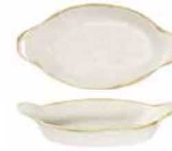
BARLEY WHITE INTERMEDIATE OVAL EARED DISH SWHSIOEN1 23.2 x 12.5cm 9 1/8 x 5" 38cl 13.4oz CTN QTY 6 SWHSSOEN1 20.5 x 11.3cm 8 1/8 x 4 5/8" 25.5cl 9oz CTN QTY 6