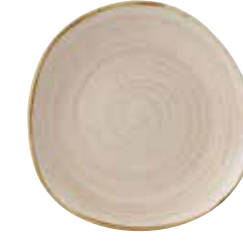
ORGANIC ROUND PLATE SNMSOG111 28.6cm 11¼" CTN QTY 12