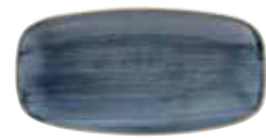
CHEFS' OBLONG PLATE No. 3 SBBSXO111 29.8 x 15.3cm 11 ¾" x 6" CTN QTY 12