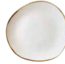
ORGANIC ROUND PLATE SWHSOG111 28.6cm 11 1 / 2 " SWHSOG101 26.4cm 10 3 / 8 " CTN QTY 12