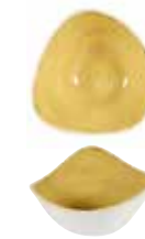
TRIANGLE BOWL SMSSTRB61 15.3cm 6" 26cl 9oz CTN QTY 12