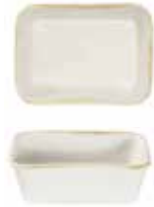
BARLEY WHITE LASAGNE DISH SWHSLASN1 16 x 12 x 5cm 6 1/8 x 4 3/4 x 2" 60cl 21.1oz CTN QTY 12