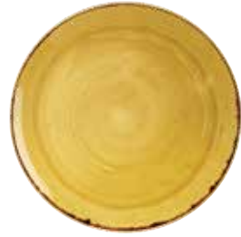
COUPE PLATE SMSSEV121 32.4cm 12¾" CTN QTY 6 ✦ SMSSEV111 28.8cm 11¼" CTN QTY 12 ✦