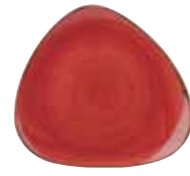
TRIANGLE PLATE SBRSTR7 1 19.2cm 7¾" CTN QTY 12