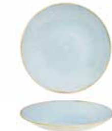
DEEP COUPE PLATE SDESPD221 22.5cm 8 5/8" H: 2.7cm CTN QTY 12 ✦