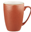
MUG SSOSVM121 34cl 12oz H: 11cm Dia: 8cm CTN QTY 12