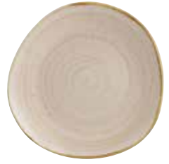
ORGANIC ROUND PLATE SNMSOG101 26.4cm 10½" CTN QTY 12