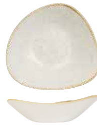
TRIANGLE BOWL SWHSTRB91 23.5cm 9 1 / 4 " 60cl 21oz SWHSTRB71 18.5cm 7 1 / 4 " 37cl 13oz SWHSTRB61 15.3cm 6" 26cl 9oz CTN QTY 12