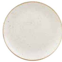
COUPE PLATE SWHSEV121 32.4cm 12 3 / 4 " CTN QTY 6 + SWHSEV111 28.8cm 11 1 / 4 " CTN QTY 12 + SWHSEV101 26cm 10 1 / 4 " CTN QTY 12 +