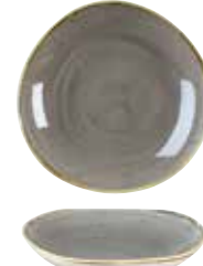
ORGANIC ROUND BOWL SPGSOGB11 25.3cm 9 7/8" CTN QTY 12