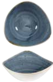
TRIANGLE BOWL SBBSTRB91 23.5cm 9¼" 60cl 21oz CTN QTY 12