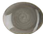
OVAL COUPE PLATE SPGSOP7 1 19.2cm 7 3/4" CTN QTY 12 ✦