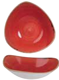
TRIANGLE BOWL SBRSTRB91 23.5cm 9¼" 60cl 21oz CTN QTY 12