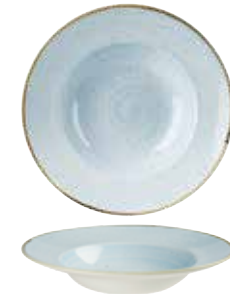
WIDE RIM BOWL SDESVWBL1 28cm 11" 46.8cl 16.5oz CTN QTY 12 ✦ SDESVWBM1 24cm 9 1/2" 28.4cl 10oz CTN QTY 12 ✦