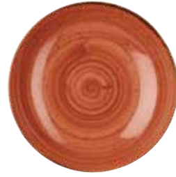
LARGE COUPE BOWL SSOSPLC21 31cm 12" 240cl 84.5oz CTN QTY 6