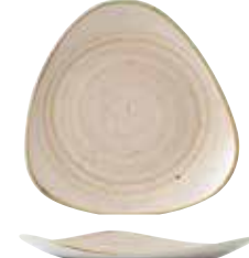
TRIANGLE PLATE SNMSTR121 31.1cm 12¼" CTN QTY 6 SNMSTR101 26.5cm 10½" CTN QTY 12