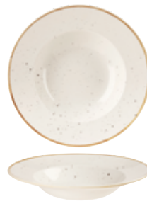
WIDE RIM BOWL SWHSVWBL1 28cm 11" 46.8cl 16.5oz CTN QTY 12 + SWHSVWBM1 24cm 9 1 / 2 " 28.4cl 10oz CTN QTY 12 +