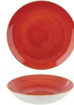
COUPE BOWL SBRSPLC21 31cm 12" 240cl 84.5oz CTN QTY 6 +