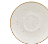
SAUCER SWHSCSS 1 15.6cm 6 1/4" CTN QTY 12 (Fits SWHSCB281, SWHSCB201 SWHSCB441 & SWHSCB401)