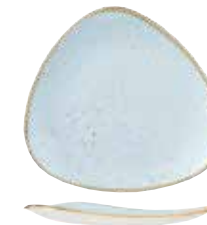
TRIANGLE PLATE SDESTR9 1 22.9cm 9" CTN QTY 12 ✦ SDESTR7 1 19.2cm 7 3/4" CTN QTY 12