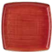
DEEP SQUARE PLATE SBRSDS101 26.8cm 10½" CTN QTY 6