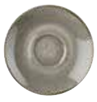
SAUCER SPGSCSS 1 15.6cm 6 1/4" CTN QTY 12 ✦ (Fits SPGSCB281 & SPGSCB201) ESPRESSO SAUCER SPGSESS 1 11.8cm 4 1/2" CTN QTY 12 ✦ (Fits SPGSCEB91)