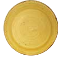
COUPE PLATE SMSSEVP81 21.7cm 8²⁄₃" CTN QTY 12 ✦