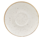
ESPRESSO SAUCER SWHSESS 1 11.8cm 4 1/2" CTN QTY 12 (Fits SWHSCB91)