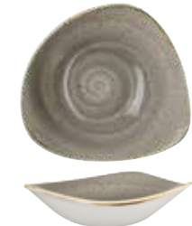
TRIANGLE BOWL SPGSTRB91 23.5cm 9 1/4" 60cl 21oz SPGSTRB71 18.5cm 7 1/4" 37cl 13oz SPGSTRB61 15.3cm 6" 26cl 9oz CTN QTY 12