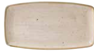
OBLONG PLATE SNMSOP141 35 x 18.5cm 14" x 7¼" CTN QTY 6