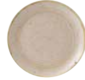
COUPE PLATE SNMSEVP61 16.5cm 6½" CTN QTY 12