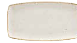
OBLONG PLATE SWHSOP141 35 x 18.5cm 14" x 7 1 / 4 " CTN QTY 6 SWHSOP111 29.5 x 15cm 11 3 / 4 " x 6" CTN QTY 12