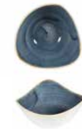
TRIANGLE BOWL SBBSTRB61 15.3cm 6" 26cl 9oz CTN QTY 12