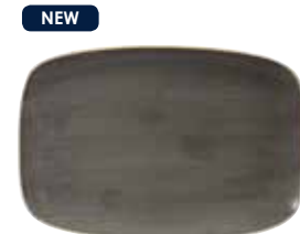
NEW PEPPERCORN GREY CHEFS' OBLONG PLATTER No. 9 SPGSXP141 35.5 x 24.5cm CTN QTY 6