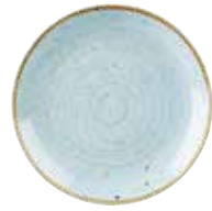
COUPE PLATE SDESEVP81 21.7cm 8 2/3" CTN QTY 12 ✦ SDESEVP61 16.5cm 6 1/2" CTN QTY 12 ✦