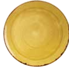
COUPE PLATE SMSSEV101 26cm 10¼" CTN QTY 12 ✦