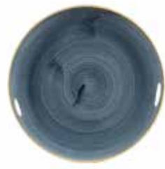
COUPE PLATE SBBSEV101 26cm 10¼" CTN QTY 12 ✦