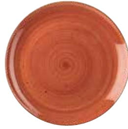
COUPE PLATE SSOSEV121 32.4cm 12¾" CTN QTY 6 SSOSEV111 28.8cm 11¼" CTN QTY 12 SSOSEV101 26cm 10¼" CTN QTY 12