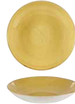
COUPE BOWL SMSPLC21 31cm 12" 240cl 84.5oz CTN QTY 6 ✦