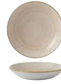
COUPE BOWL SNMSEVB91 24.8cm 9¾" 113.6cl 40oz CTN QTY 12 SNMSEVB71 18.2cm 7¼" 42.6cl 15oz CTN QTY 12