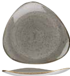
TRIANGLE PLATE SPGSTR121 31.1cm 12 1/4" CTN QTY 6 SPGSTR101 26.5cm 10 1/2" CTN QTY 12 SPGSTR9 1 22.9cm 9" CTN QTY 12 SPGSTR7 1 19.2cm 7 3/4" CTN QTY 12