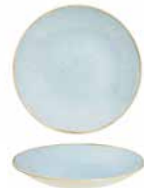
DEEP COUPE PLATE SDESPD251 25.5cm 10" H: 3.5cm CTN QTY 12 ✦