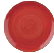
COUPE PLATE SBRSEVP81 21.7cm 8²/₃" CTN QTY 12 +