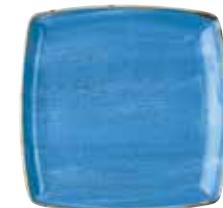
DEEP SQUARE PLATE SCFSDS101 26.8cm 10½" CTN QTY 6