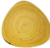
TRIANGLE PLATE SMSSTR9 1 22.9cm 9" CTN QTY 12