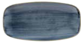
CHEFS' OBLONG PLATE No. 4 SBBSXO141 35.5 x 18.9cm 13 ⅞" x 7 ⅝" CTN QTY 6