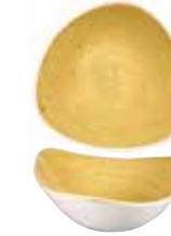
TRIANGLE BOWL SMSSTRB71 18.5cm 7¼" 37cl 13oz CTN QTY 12