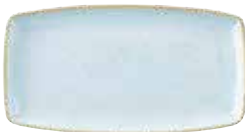
OBLONG PLATE SDESOP141 35 x 18.5cm 14" x 7 1/4" CTN QTY 6 ✦ SDESOP111 29.5 x 15cm 11 3/4" x 6" CTN QTY 12