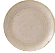
COUPE PLATE SNMSEVP81 21.7cm 8 5/8" CTN QTY 12