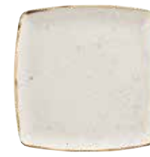
DEEP SQUARE PLATE SWHSDS101 26.8cm 10 1 / 2 " CTN QTY 6