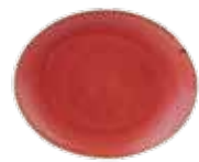
OVAL COUPE PLATE SBR SOP7 1 19.2cm 7¾" CTN QTY 12 +