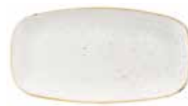
OBLONG PLATE No. 4 SWHSXO141 35.5 x 18.9cm 13 7 / 8 " x 7 3 / 8 " CTN QTY 6 No. 3 SWHSXO111 29.8 x 15.3cm 11 3 / 4 " x 6" CTN QTY 12 No. 2 SWHSXO101 26.9 x 12.7cm 10 1 / 2 " x 5" CTN QTY 12 No. 1 SWHSXO7 1 20 x 12.1cm 7 2 / 5 " x 4 1 / 4 " CTN QTY 12