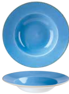
WIDE RIM BOWL SCFSVWBL1 28cm 11" 46.8cl 16.5oz CTN QTY 12