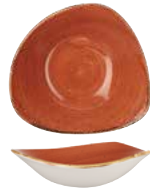
TRIANGLE BOWL SSOSTRB91 23.5cm 9¼" 60cl 21oz CTN QTY 12 SSOSTRB71 18.5cm 7¼" 37cl 13oz CTN QTY 12