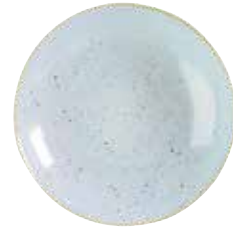
LARGE COUPE BOWL SDESPLC21 31cm 12" 240cl 84.5oz CTN QTY 6 ✦