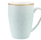
MUG SDESVM121 34cl 12oz H: 11cm Dia: 8cm CTN QTY 12