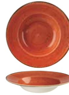
WIDE RIM BOWL SSOSVWBL1 28cm 11" 46.8cl 16.5oz CTN QTY 12 SSOSVWBM1 24cm 9½" 28.4cl 10oz CTN QTY 12