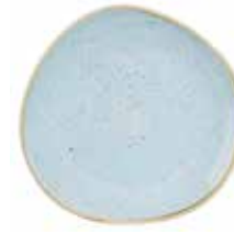
ORGANIC ROUND PLATE SDESOG111 28.6cm 11 1/4" SDESOG101 26.4cm 10 3/8" CTN QTY 12