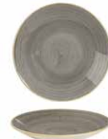
DEEP COUPE PLATE SPGSPD271 28.1cm 11" H: 3.7cm CTN QTY 12 ✦ SPGSPD251 25.5cm 10" H: 3.5cm CTN QTY 12 ✦ SPGSPD221 22.5cm 8 5/6" H: 2.7cm CTN QTY 12 ✦