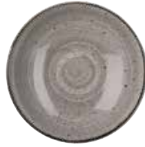
COUPE BOWL SPGSEVB91 24.8cm 9 3/4" 113.6cl 40oz CTN QTY 12 ✦ SPGSEVB71 18.2cm 7 1/4" 42.6cl 15oz CTN QTY 12 ✦