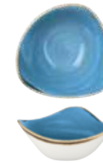
TRIANGLE BOWL SCFSTRB61 15.3cm 6" 26cl 9oz CTN QTY 12