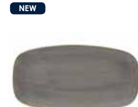
NEW PEPPERCORN GREY CHEFS' OBLONG PLATE No. 4 SPGSXO141 35.5 x 18.9cm CTN QTY 6 No. 3 SPGSXO111 29.8 x 15.3cm CTN QTY 12 No. 2 SPGSXO101 26.9 x 12.7cm CTN QTY 12 No. 1 SPGSXO7 1 20 x 12.1cm CTN QTY 12