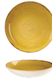
COUPE BOWL SMSSEVB91 24.8cm 9¾" 113.6cl 40oz CTN QTY 12 ✦ SMSSEVB71 18.2cm 7¼" 42.6cl 15oz CTN QTY 12 ✦