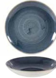
COUPE BOWL SBBSEVB91 24.8cm 9¾" 113.6cl 40oz CTN QTY 12 ✦