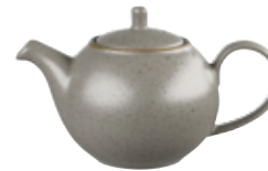
BEVERAGE POT SPGSSB151 42.6cl 15oz H: 10.5cm CTN QTY 4 REPLACEMENT LID SPGSRL151 CTN QTY 6