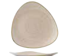
TRIANGLE PLATE SNMSTR91 22.9cm 9" CTN QTY 12