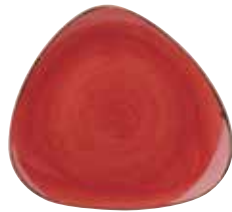
TRIANGLE PLATE SBRSTR121 31.1cm 12¼" CTN QTY 6 SBRSTR101 26.5cm 10½" CTN QTY 12