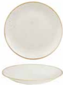
DEEP COUPE PLATE SWHSPD271 28.1cm 11" H: 3.7cm CTN QTY 12 + SWHSPD251 25.5cm 10" H: 3.5cm CTN QTY 12 + SWHSPD221 22.5cm 8 5 / 8 " H: 2.7cm CTN QTY 12 +