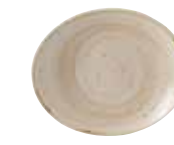
OVAL COUPE PLATE SNMSOP71 19.2cm 7¾" CTN QTY 12