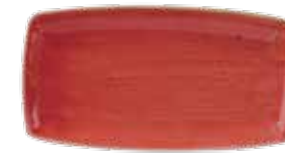
OBLONG PLATE SBR SOP141 35 x 18.5cm 14" x 7¼" CTN QTY 6