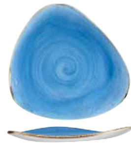
TRIANGLE PLATE SCFSTR121 31.1cm 12¼" CTN QTY 6 SCFSTR101 26.5cm 10½" CTN QTY 12