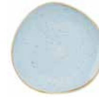
ORGANIC ROUND PLATE SDESOG8 1 21cm 8 1/4" SDESOG7 1 18.6cm 7 1/4" CTN QTY 12