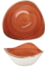
TRIANGLE BOWL SSOSTRB61 15.3cm 6" 26cl 9oz CTN QTY 12