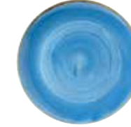
COUPE BOWL SCFSEVB71 18.2cm 7¼" 42.6cl 15oz CTN QTY 12