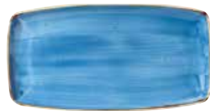
OBLONG PLATE SCFSOP141 35 x 18.5cm 14" x 7¼" CTN QTY 6