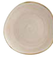
ORGANIC ROUND PLATE SNMSOG71 18.6cm 7¼" CTN QTY 12