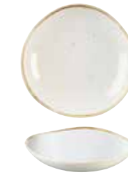
ORGANIC ROUND BOWL SWHSOGB11 25.3cm 9 3 / 8 " 110cl 38oz CTN QTY 12