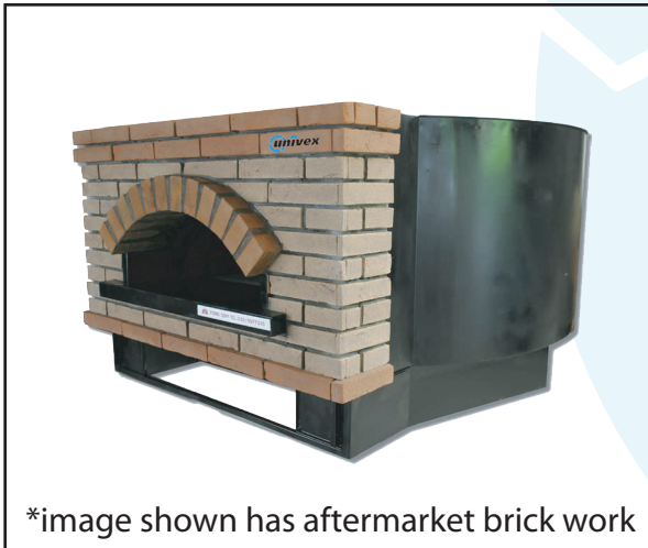
*image shown has aftermarket brick work