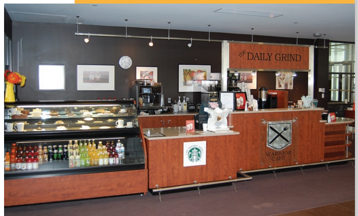
Wounded Warrior Cafe, Bethesda, MD

We have 40 years of specialized experience servicing VA Medical Centers, Federal Medical Centers, Bureau of Prisons, all branches of the Military and other federally funded government entities. TriMark Gill Marketing exclusively represents over 50 manufacturers and their product lines on various Federal contracts. We believe in partnering with our manufacturers; we carry a select group of premier companies that best serve our customers needs.