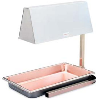
Cayenne® OHC-500 Heat Lamp