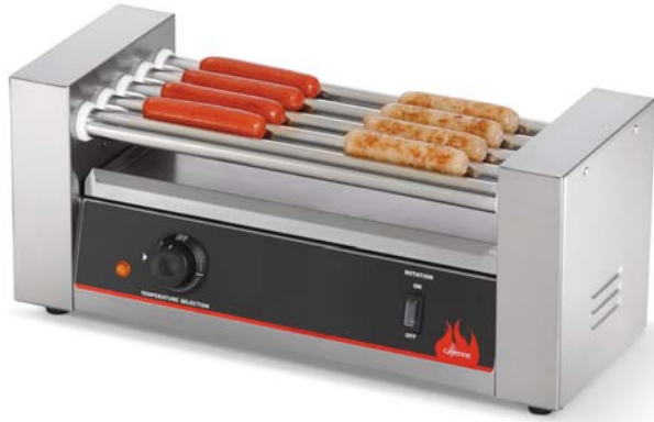
Cayenne® Hot Dog Roller Grill