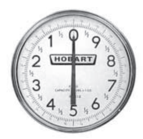
8 HOBART 2