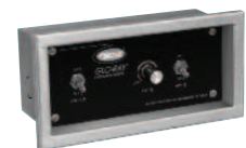
For GRN4L Models: 1 dimmer, 2 toggle switches