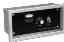
For GRN4 Models: 1 dimmer, 1 toggle switch

Cutout Dimensions: 8.094" W x 3.5"H (206 x 89 mm)