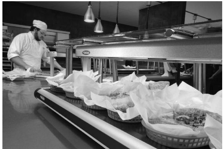
Model GRN4L-48 in Stainless Steel over Glo-Ray Portable Heated Shelf Model GR2S-36