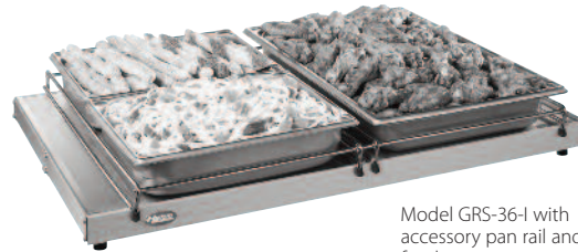
Model GRS-36-I with accessory pan rail and food pans