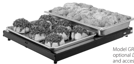
Model GRS-30-I with optional Designer color and accessory food pans

BLANKET ELEMENTS GUARANTEED AGAINST BURNOUT AND BREAKAGE FOR ONE YEAR.