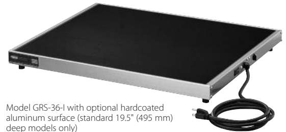
Model GRS-36-I with optional hardcoated aluminum surface (standard 19.5" (495 mm) deep models only)