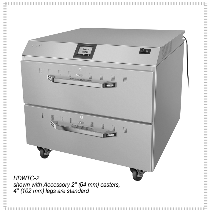
HDWTC-2 shown with Accessory 2" (64 mm) casters, 4" (102 mm) legs are standard