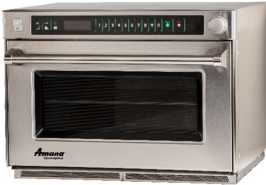
Model AMSO22 shown