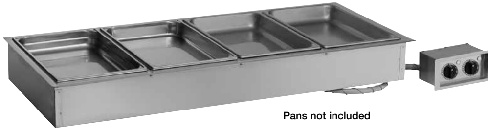
Pans not included