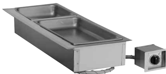
100-HW/D443 (Pans not included)