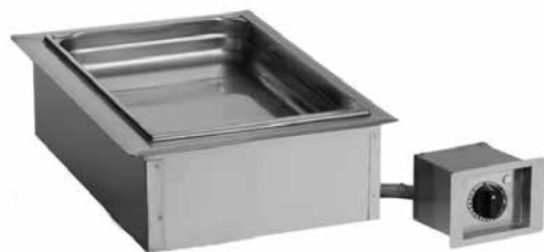
100-HW/D4 (Pan not included)

• The gentle heating capability of HALO HEAT significantly extends hot food holding life without continuing the cooking process.