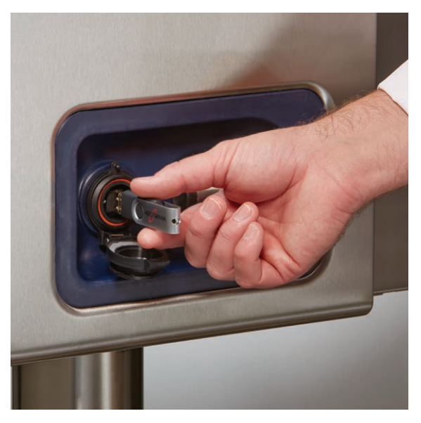
HACCP data access records cooking modes, times and temperatures used during the previous 30 days, all downloadable to a USB device.

Simple, intuitive, one-touch cooking on the large PROtouch control makes it easy to standardize food quality and consistency every time.