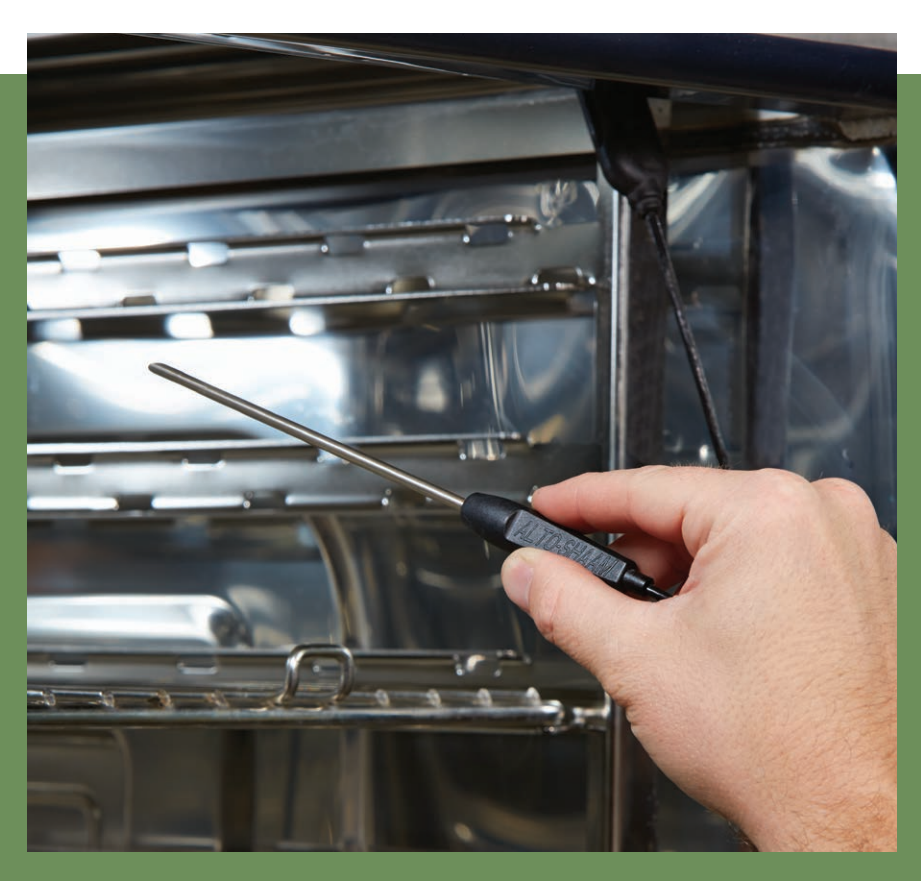
Detachable food probe is designed to break away, minimizing costly repairs and equipment downtime.